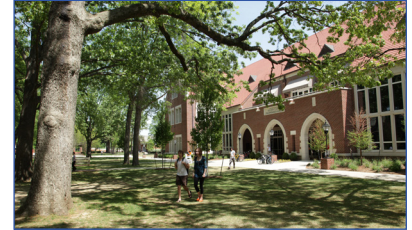
Hendrix College Conway, ARKANSAS