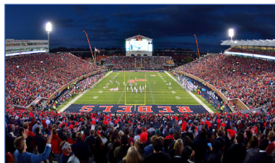
University of Mississippi Oxford, MISSISSIPPI