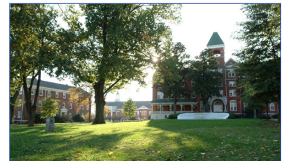
Morehouse College Atlanta, GEORGIA

NEED HELP EXPLORING OPTIONS? WE'RE HERE TO HELP. CREATE AN ACCOUNT & START YOUR APPLICATION: www.isepstudyabroad.org/apply