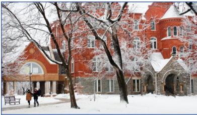
Macalester College St. Paul, MINNESOTA