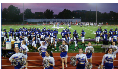
Truman State University Kirksville, MISSOURI