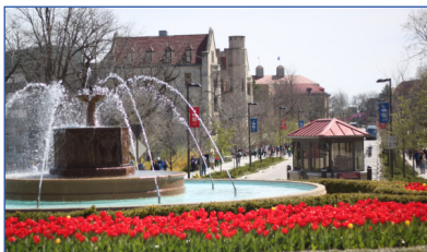
University of Kansas Lawrence, KANSAS