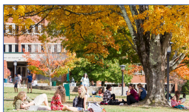
Appalachian State University Boone, NORTH CAROLINA