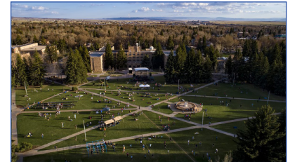
University of Wyoming Laramie, WYOMING