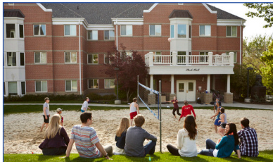
Westminster College Salt Lake City, UTAH