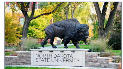
North Dakota State University Fargo, NORTH DAKOTA