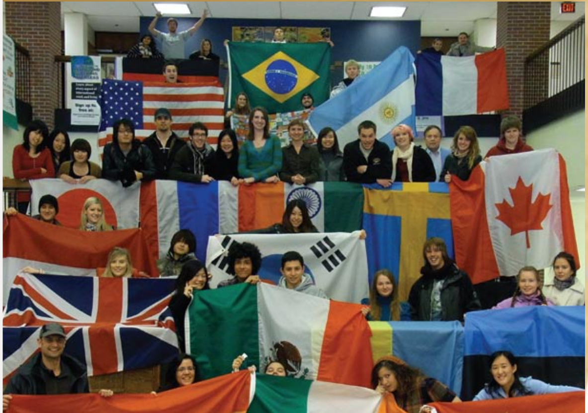
Nebraska Wesleyan University 2010 International Student Celebration